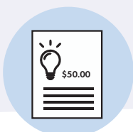
Current Utility Bill