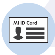
State ID Card