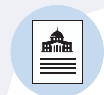
Other Government Document