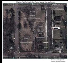
BRIGHT STAR FARM , BATTLE CREEK